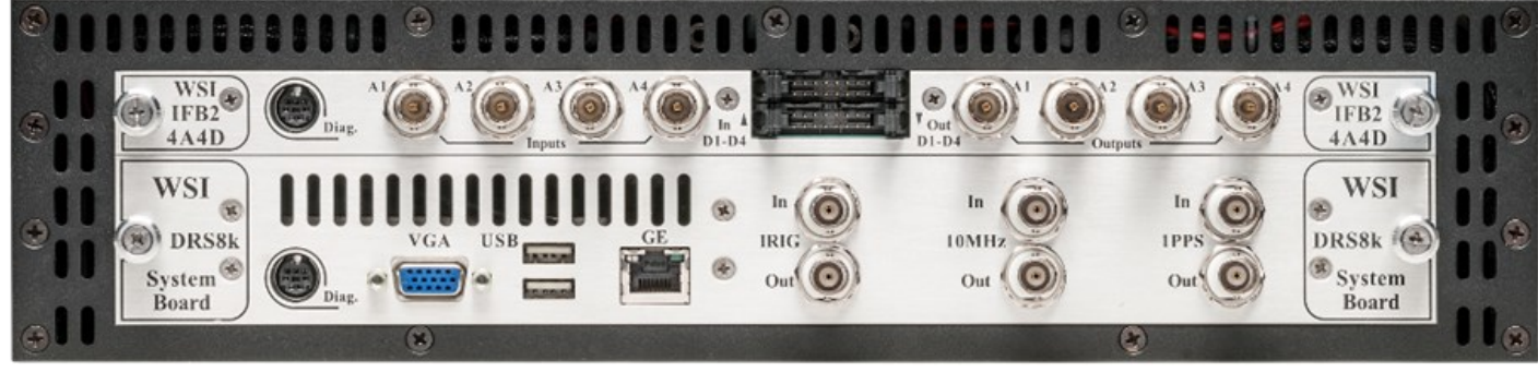
*All system boards now come standard with a Display Port and dual USB 3.0 ports. VCA is no longer offered as a standard video output.

Can be provided quickly and cost-effectively