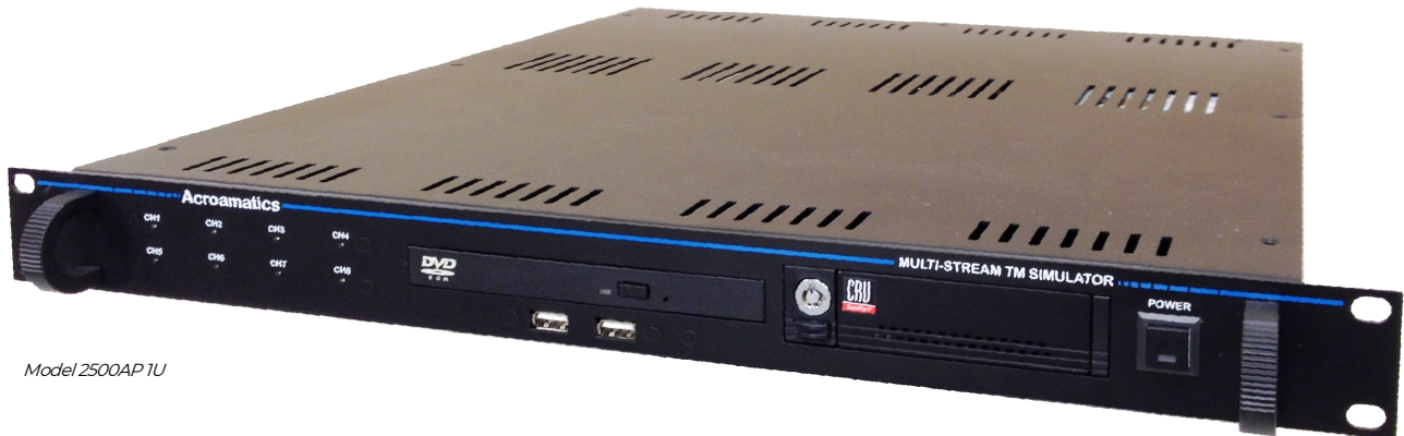
Model 2500AP 1U