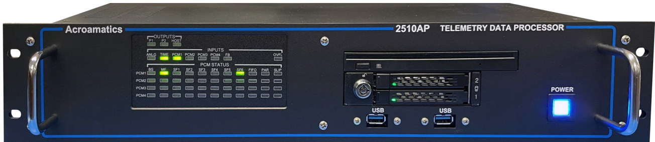
Model 2510AP 2U