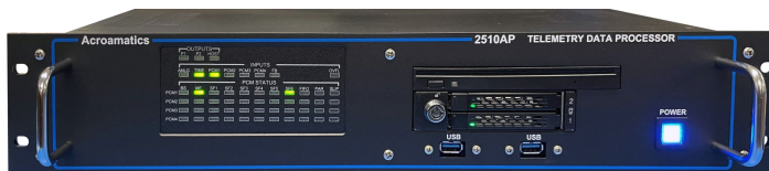
Model 2510AP 2U