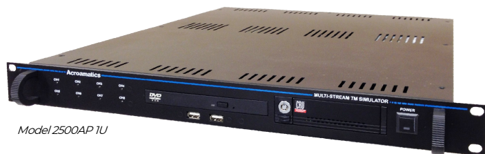
Model 2500AP 1U

Delivered with either DOD SHB compliant Windows 11 Pro, Win 10 Enterprise LTSC, or LINUX RHEL 8.x OS or LINUX RedHat 7 OS, Acroamatics OS application independent low-latency card embedded processors guarantee that users will have ample processing potential to meet the most complex quick-look, recording and networked server client display and analysis needs.